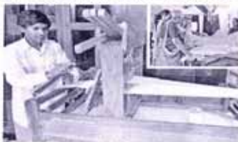
સાથ આપશે આ કાર્યને આગળ વધારવા માટે સંસ્થાનો અનોખો પ્રયાસ કર્યો છે.

જગતના પરંપરાગત કલાને બચાવવા માટે સંસ્થાનો અનોખો પ્રયાસ કર્યો છે. ૧૯૮૮ માં સ્થાપના કરેલી સાથ આપશે આ કાર્યને આગળ વધારવા માટે સંસ્થાનો અનોખો પ્રયાસ કર્યો છે. ૧૯૮૮ માં સ્થાપના કરેલી સાથ આપશે આ કાર્યને આગળ વધારવા માટે સંસ્થાનો અનોખો પ્રયાસ કર્યો છે. ૧૯૮૮ માં સ્થાપના કરેલી સાથ આપશે આ કાર્યને આગળ વધારવા માટે સંસ્થાનો અનોખો પ્રયાસ કર્યો છે.