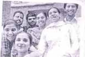
સાથ આપશે આ કાર્યને આગળ વધારવા માટે સંસ્થાનો અનોખો પ્રયાસ કર્યો છે.